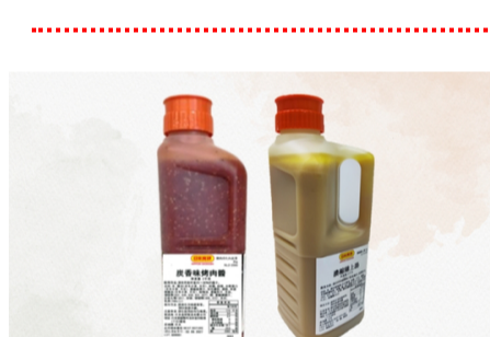
日本食研控股有限公司 Nihon Shokken Holdings Company Limited 展位 Booth: 5F-F31

日本食研是日本首屈一指的複合調味料製造商之一，重點產品包括有炭火風味的極品燒肉汁及帶有層次的濃縮雞上湯。