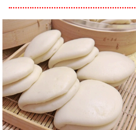
台揚食品有限公司 Ocean Tai Foods Co. Ltd 展位 Booth: 5F-E30

揉些麵團做的刈包，滷三層肉和炒酸菜，加上少許花生碎和香菜。這就是台灣人記憶裡的家鄉味道！