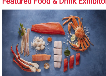
美國阿拉斯加海產市場協會 Alaska Seafood Marketing Institute 展位 Booth: 5F-C06

阿拉斯加海鮮以其優質、可持續捕撈的魚類與貝類聞名。不僅風味絕佳，亦支持全球負責任且環保的漁業實踐。