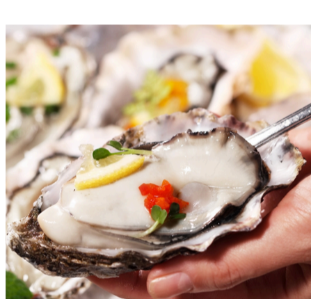
祥泰行食品有限公司 Cheung Tai Hong Foods Limited 展位 Booth: 5F-C21

歐盟認證，可生食用，以先進嚴格技術急凍淨化，-50°C或以下冷藏，肉身雪白飽滿鮮甜。