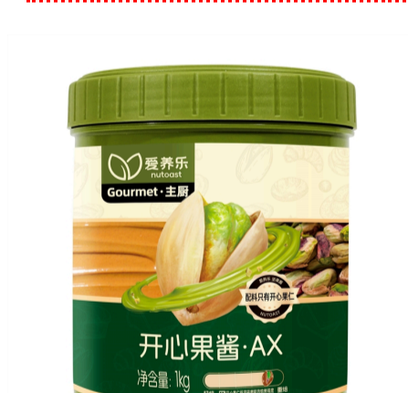
杭州加森食品科技有限公司 Hangzhou Jiasen Food Technology Co., Ltd. 展位 Booth: 5F-E31